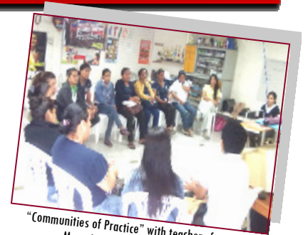
"Communities of Practice" with teachers from the Juan Montalvo school, County of El Triunfo.