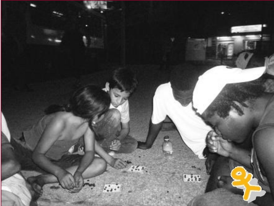
Neighborhoods in the North and South of Guayaquil