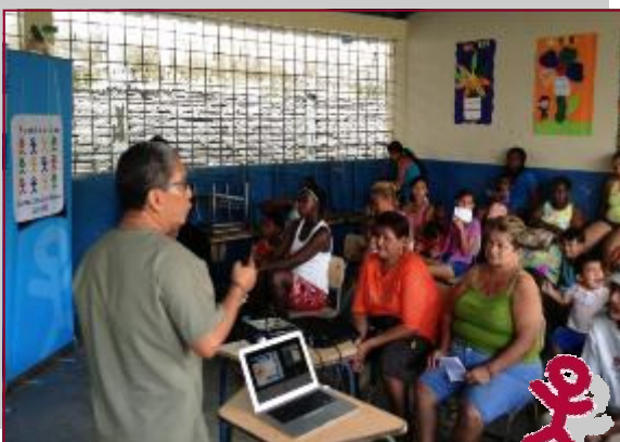
Dengue prevention and treatment talks for mothers and fathers.

For the winter season Cruz Azul pharmacies engaged in a campaign for the prevention of dengue through talks about health for the most vulnerable communities of Guayaquil.