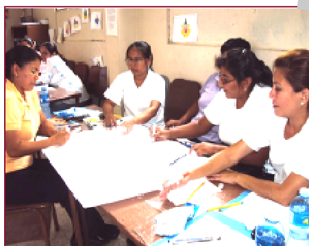
Teachers from Marcel Laniado School, Naranjal County making a floor plan of the school to locate safe sites and sites of risk for the children.

"Love is to a child what sun is to a flower; Bread is not enough: they need care to be good and strong." Concepción Arenal