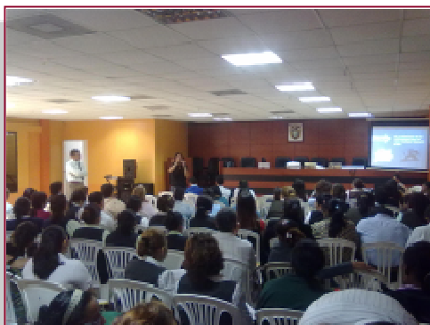
"Coexistence Codes" workshop with teachers from different public schools in the county of El Triunfo.